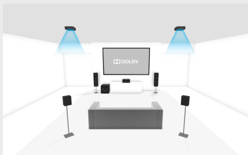
Perspective detail for 5.1.2 setup

This refers to how many overhead or Dolby Atmos enabled speakers you can use in your Dolby Atmos capable setup.